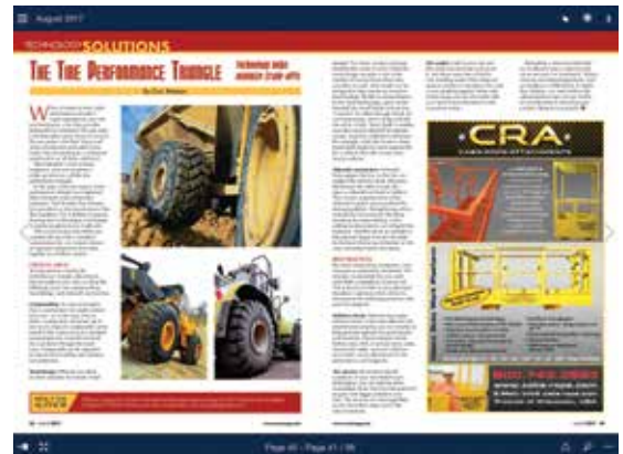
MCS Digital Edition

*For full page ads and two-page spreads, add a bleed of at least .125" (1/8 inch) on all sides